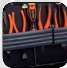
4750RC021 and 4750RCW011 Rubber Strips