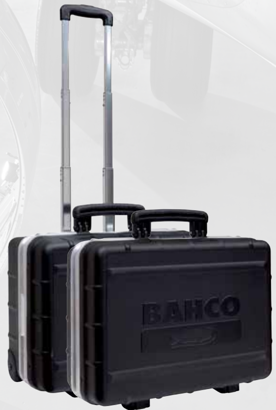
4750RCW01 / 4750RCW011 4750RC02 / 4750RC021