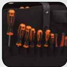
4750RC02 and 4750RCW01 Plastic Pouches