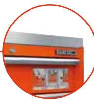
STAINLESS STEEL TOP