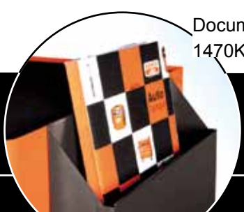
Document Holder 1470K-AC4