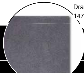
Drawer Liners 1470KAC01